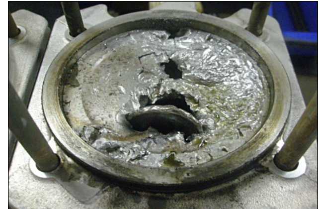
Tear-down photo from Roy Thoma's Rotax engine. Look for an article in a future chapter newsletter issue.