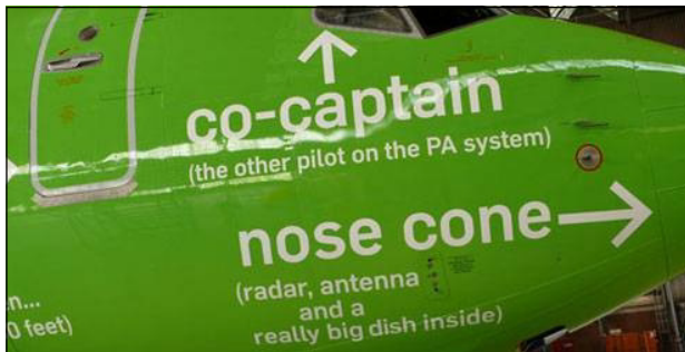
South Africa's Kalula Airlines.