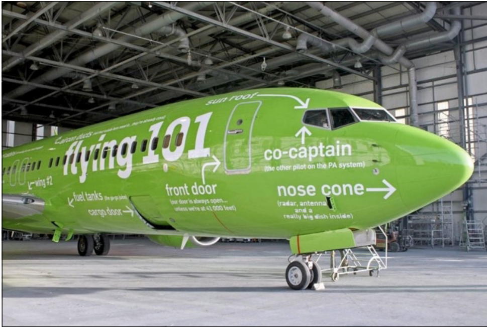
South Africa's Kalula Airlines — Several other photos of the plane are scattered through this issue.